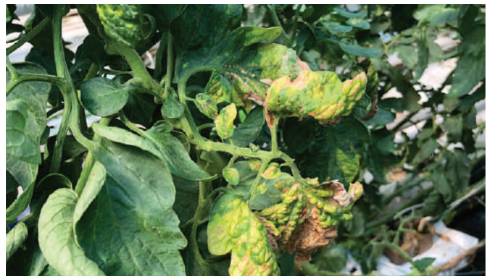
Tomato plants infected with typical tomato brown rugose fruit virus (ToBRFV) symptoms.