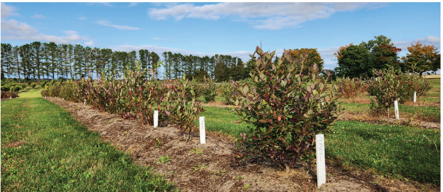
Blueberry bush trials at the Agriculture and Agri-Food Canada Kentville Research and Development Centre in Nova Scotia.

There were delays in developing testing agreements with Advanced Berry Breeding in the Netherlands to