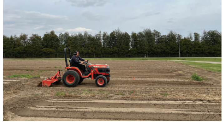
Biofumigation preparation using rototiller for mixing the topsoil and chopped mustard before compacting in Simcoe, Ont.