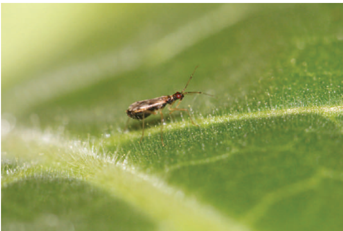
A female D. discrepans .