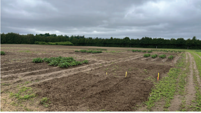
Plots after cultivation with potatoes, cash crop and green manure in Simcoe, Ont.