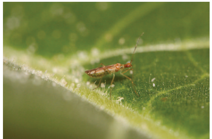
A female D. famelicus .