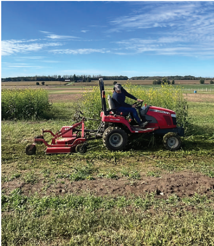
Biofumigation preparation using a mower for chopping the mustard plants at Simcoe, Ont. crop rotation plots.