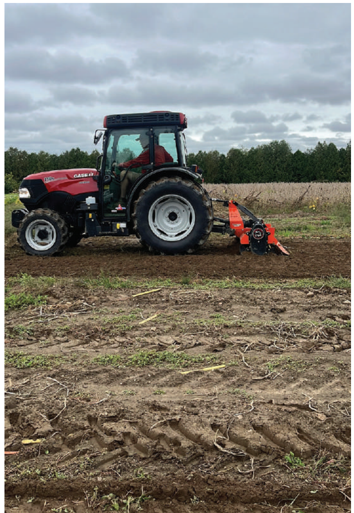
Plot preparation for planting cash crops at Simcoe, Ont. crop rotation plots.