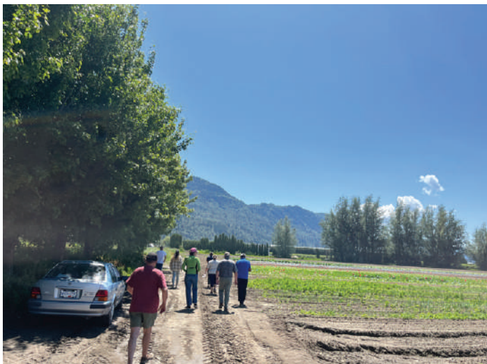
On June 19, 2024 a field session was held in Abbotsford, B.C. to examine the field plots of the cabbage root maggot insecticide efficacy trials.