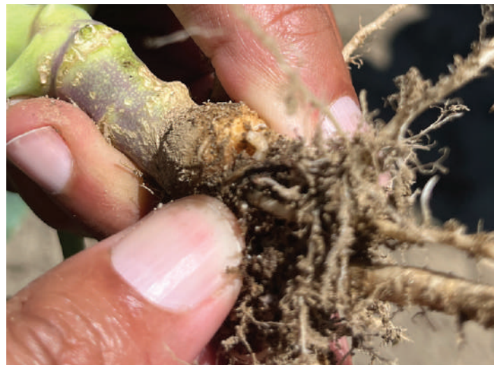
Close up of cabbage maggots on Brussels sprout roots.