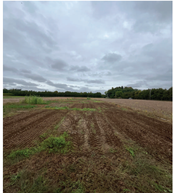
Plots after biofumigation practices in Simcoe, Ont.