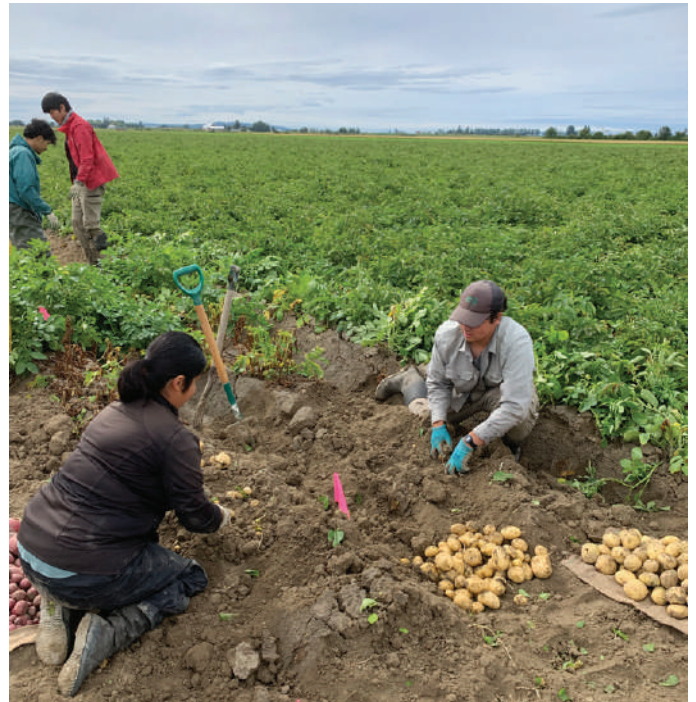
Research plots being dug up for the 2024 field day at Delta, B.C.