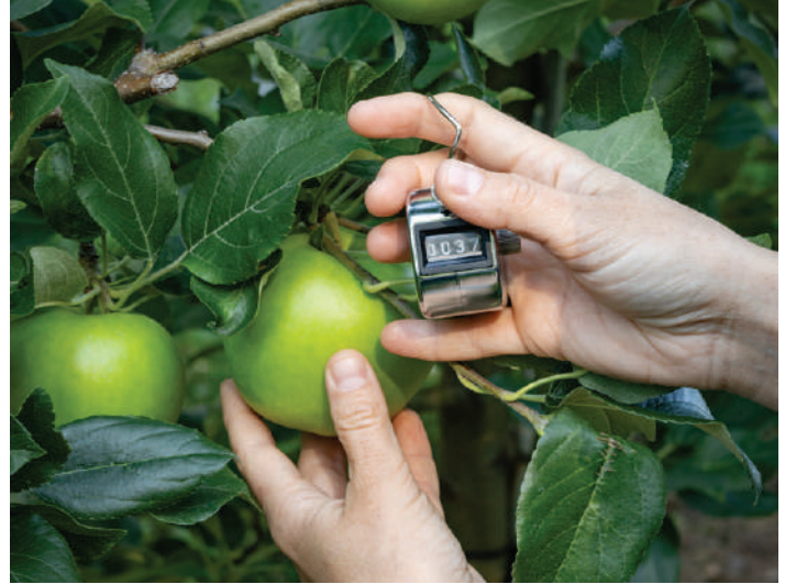
Following treatments with fruit thinning products and strategies, the Nova Scotia team counts fruit set and calculates crop load to determine efficacy.