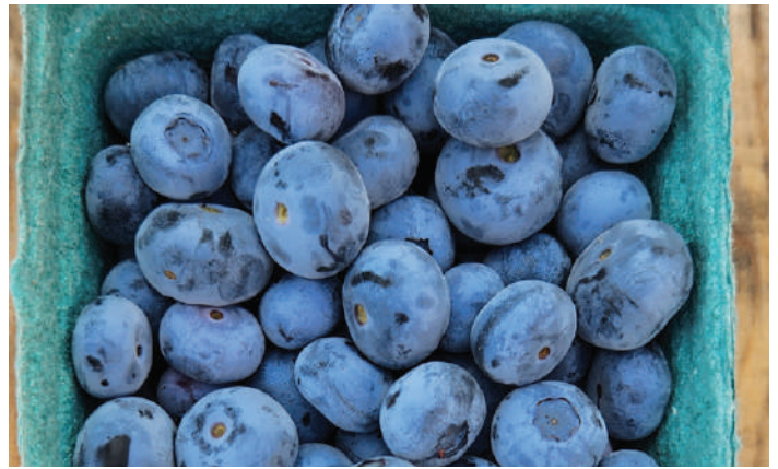
Calypso, a new blueberry with high yields in trials in British Columbia.

Strawberry field trials at the Agriculture and Agri-Food Canada Kentville Research and Development Centre in Nova Scotia.