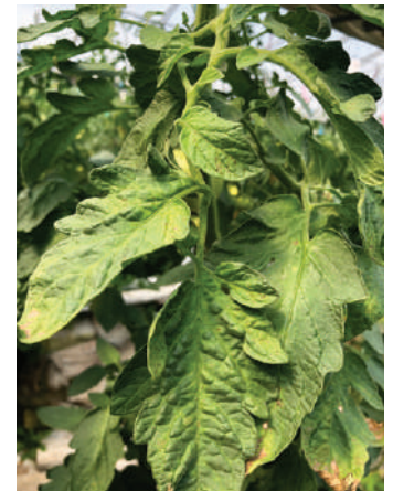
Tomato plants infected with tomato brown rugose fruit virus (ToBRFV).