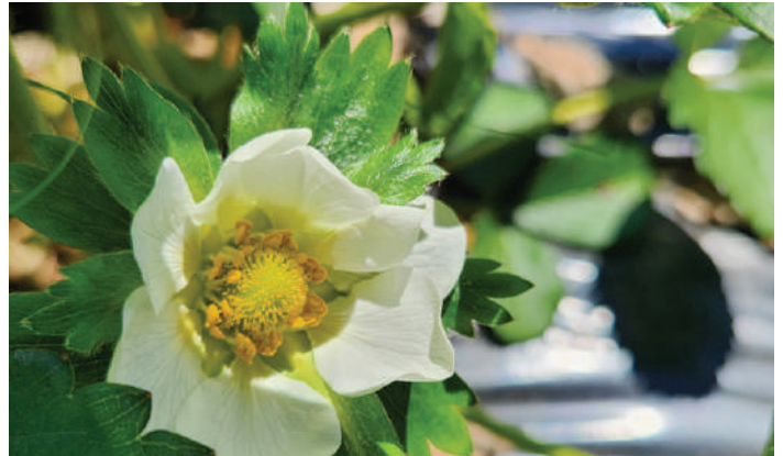
A flower on a strawberry plant at the Agriculture and Agri-Food Canada Kentville Research and Development Centre in Nova Scotia.