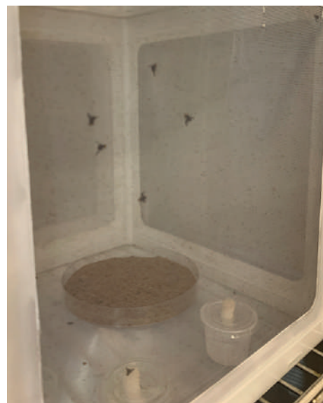
FAR LEFT: A BugDorm where sterile flies emerge from sand post-sterilization in preparation for use in laboratory or field studies. LEFT: A BugDorm containing 10 pairs of sterile flies and one pair of non-sterile flies in order to determine the ratio of sterile to non-sterile to prevent stings on apples.