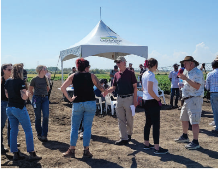
Attendees at the 2024 field day at the Lethbridge, Alta. trial site.