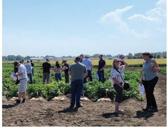
Attendees at the 2024 field day at the Lethbridge, Alta. trial site.