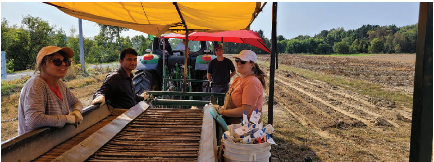
Harvesting potatoes at the New Brunswick trial site.

For 2025, industry variety trials are planned for B.C., Alberta, Manitoba, Ontario and Quebec. Common varieties will be selected to allow for comparisons across the country. AAFC trials will be conducted in Alberta, Saskatchewan, Manitoba, Ontario, Quebec, New Brunswick and P.E.I. Selections with positive feedback from the field days and those with promising attributes from the data collected will advance in the commercialization pipeline. The most advanced selections will be offered to industry for field trials.